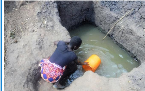
Example photo of alternate water source

Number of People Served: 550 Adults + 487 Children = 1037 Villagers