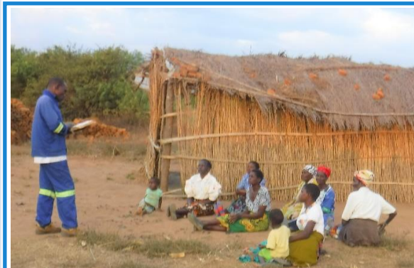
87,000+ villagers have responded to the gospel since 2008!

6 people from CHAKUYINGA VILLAGE gave their lives to the Lord!