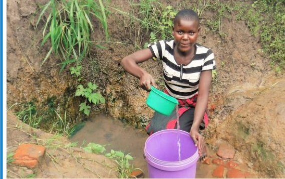
ACTUAL photo of alternate water source

Number of People Served: 1011 Adults + 1001 Children = 2012 Villagers