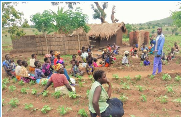
82,000+ villagers have responded to the gospel since 2008!

11 people from KUTHAMBO VILLAGE gave their lives to the Lord!